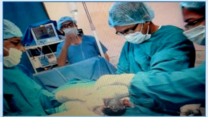
Baitadi surgical team performing its first caesarean section on 7th June 2012 (25th Jestha 2069)