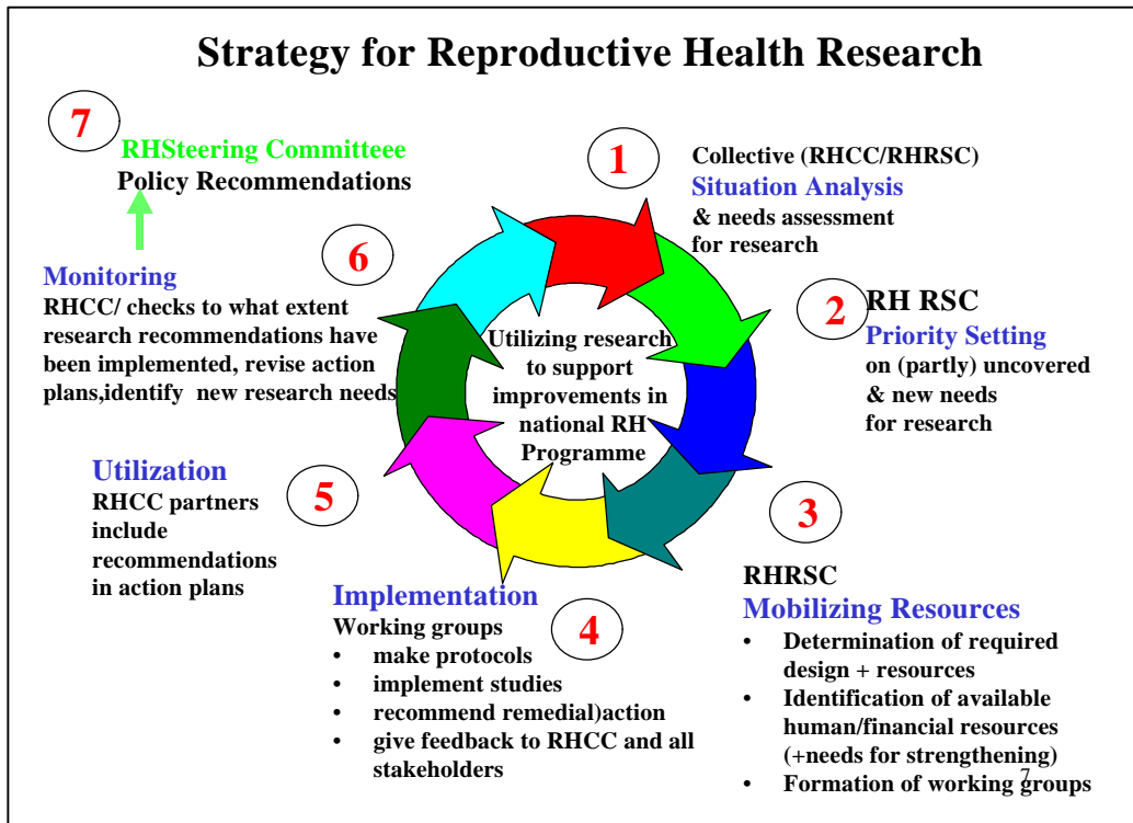
Figure 2: Seven-step strategy for RH research

Step 1: Situation analysis of research carried out and of research needs Determined by the national RH objectives as well as by RHCC/RTRSC members and "the field" (local government/NGO staff and community members)